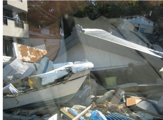
Debris of Disaster, Boat on the land, photo taken from the inside of the car

Then tsunami pushed and crushed all the cars to the building, and they caught fire and the fire spread over the school building. It looked like an inferno. I saw several bouquets of flowers here and there dedicated near by the entrance of the school, which indicated that some pupils and adults had lost their lives there.