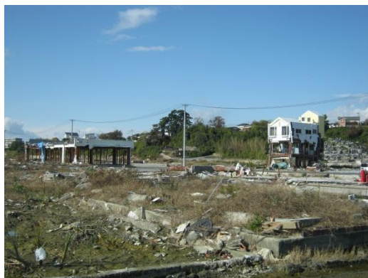
The destroyed fisher village of Ishinomaki

Only a few weeks ago, I was literally standing the wilderness; but not the one in Israel, one in Japan. I visited Ishinomaki, Miyagi Prefecture a medium size local city with one hundred sixty thousand residents. When the great earthquake and tsunami hit the North-Eastern region of Japan, it took more than three thousand lives instantly and nearly seven hundred people are still missing today, eight months after the tragedy.